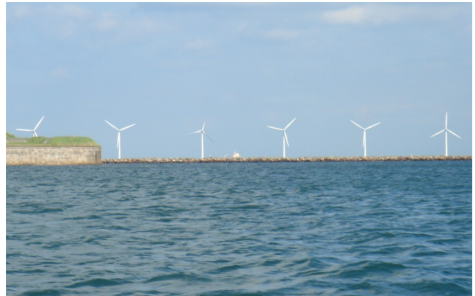
Middelgrunden offshore wind farm - Copenhagen, Denmark

Aside from the many environmental benefits of wind energy – including improved air quality and water savings from the energy sector - communities across the country are excited about wind energy's economic development potential. As of 2009, the wind industry supported 85,000 jobs over all 50 states and by 2010 there were nearly 400 American manufacturing facilities for wind energy components.